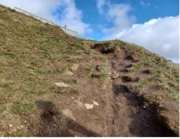
Erosion damage to archaeological features due to visitor volume.