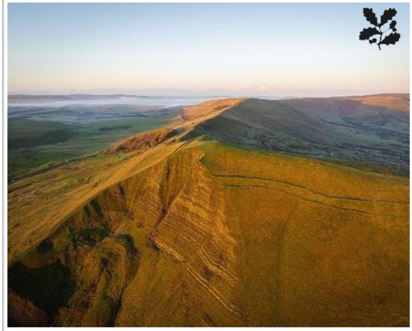
Landowners' Perspectives on the Benefits and Challenges of Public Access